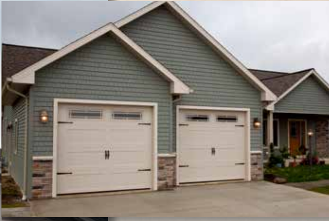
674 in sahara tan with prairie windows, hinges and handles