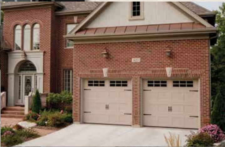
660 in sandstone with 6-pane windows, hinges and handles