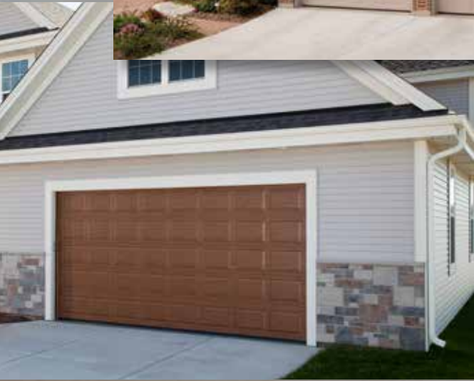
680 in embossed ash